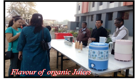
Flavour of organic Juices