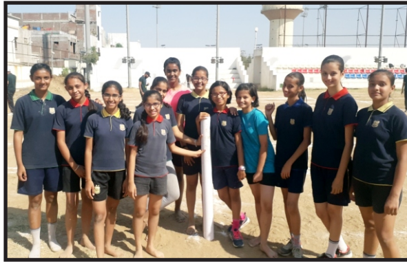
U-14 Girls KHO-KHO team bagged 3rd position in VNM KHEL UTSAV 2019.