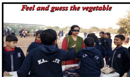
Feel and guess the vegetable