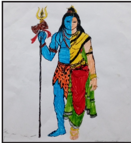
Soham Vaidya - 2A