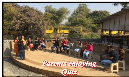
Parents enjoying Quiz