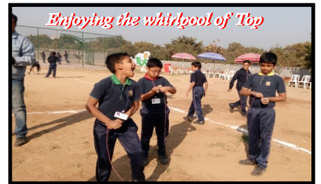
Enjoying the whirlpool of Top