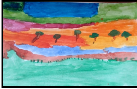
Yuvraj Kansara - 3B