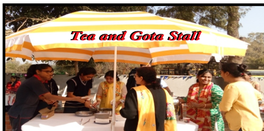
Tea and Gota Stall