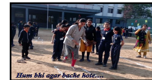
Hum bhi agar bache hote....