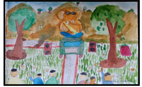
Abhiraj Singh Devkar - 2B