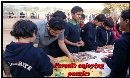
Parents enjoying puzzles